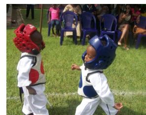
Inter-house Sports Activity

Well done to all our wonderful teachers, parents and pupils!